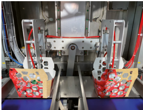
High speed up to 80 p/min independently from tray type thanks Crankshaft system

Dualfunction - denesting of different trays per unit - up to 40 p/min per side