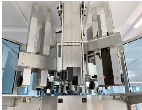
Filling access from the bottom - 3 Towers can be filled during the work process