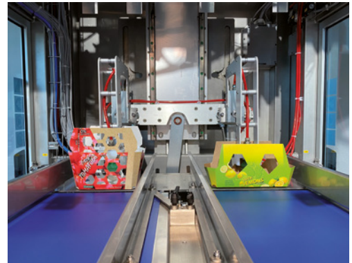
DUAL function: 2 rotating tower units - different tray types can be processed on each side