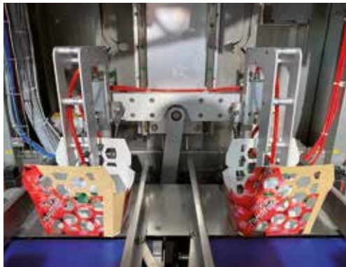
High speed up to 80 p/min independently from tray type thanks Crankshaft system

Dualfunction – denesting of different trays per unit – up to 40 p/min per side