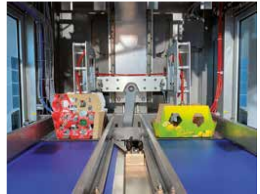
DUAL function: 2 rotating tower units - different tray types can be processed on each side