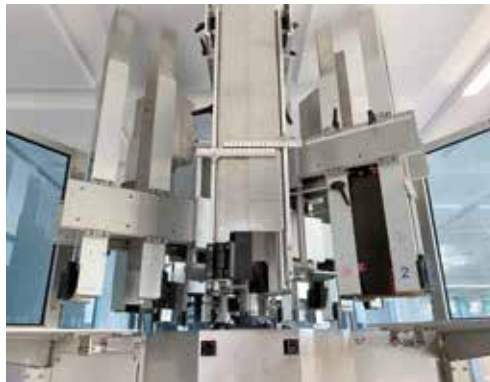
Filling access from the bottom - 3 Towers can be filled during the work process